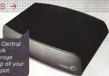
The Seagate Central ($190) network-attached storage drive backs up all your data in one spot.