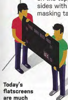
Today's flatscreens are much lighter than those of yore—so light, in fact, they can be hung on the single wire of the OmniMount LEDW60.

Get the rat's nest of wires behind your A/V cabinet under control. Unplug everything, then replug in one component at a time. Coil up any slack and cinch the loops with Velcro ties.